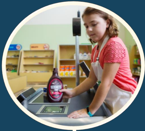
La Montanita Grocery Store