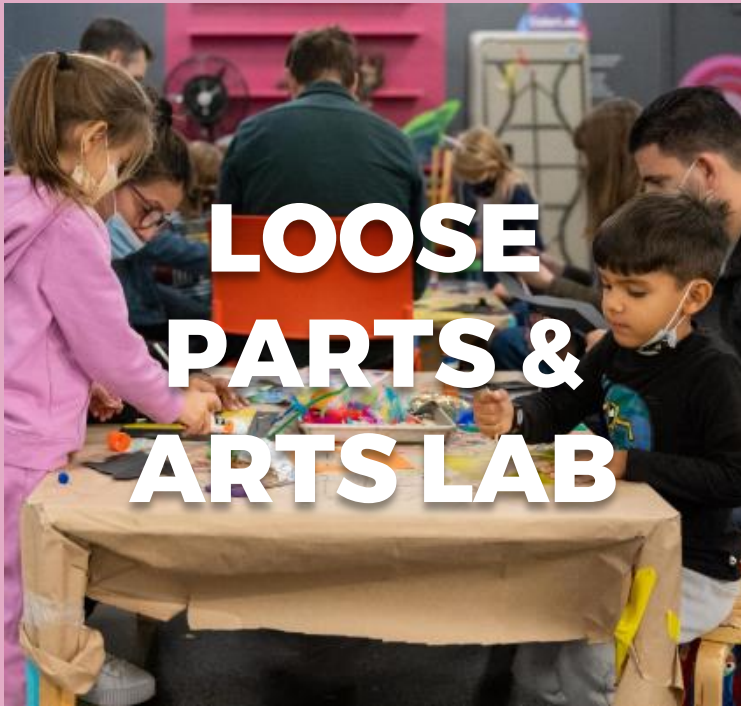
LOOSE PARTS & ARTS LAB