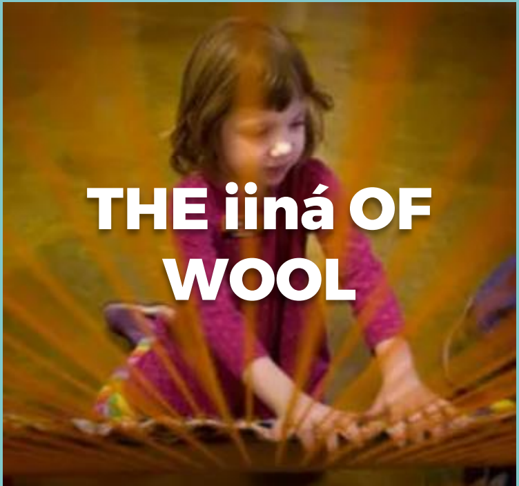
THE iiná OF WOOL