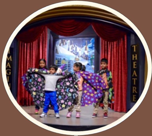
EL Morro Theater