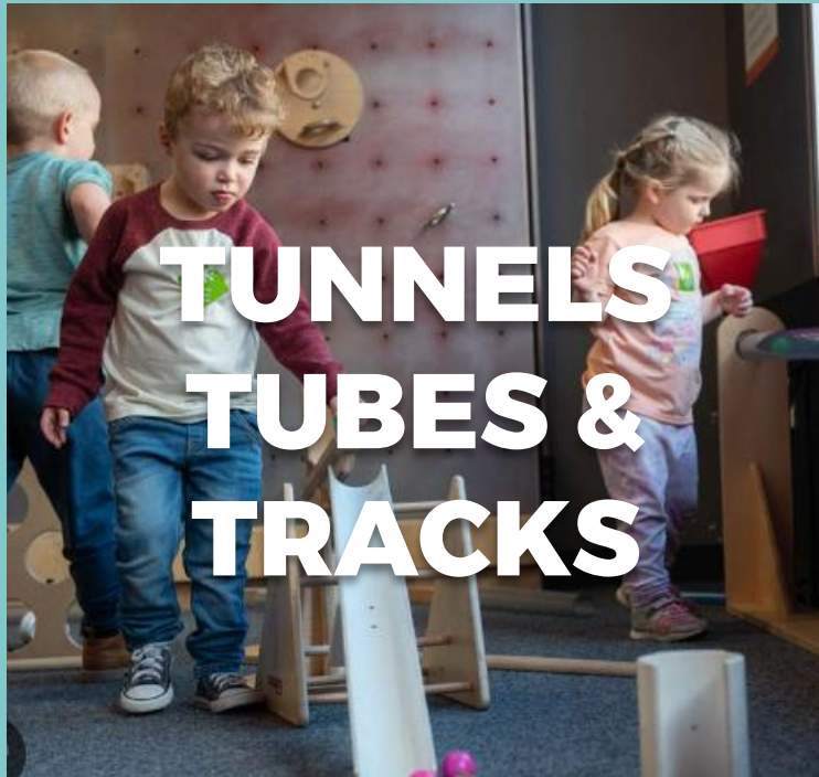
TUNNELS TUBES & TRACKS